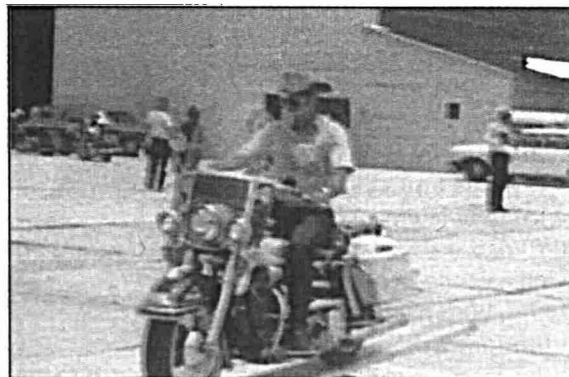
Early Poker Run field meet

and ends at 5 p.m. Saturday at the Conch Republic Seafood Co. in Key West.