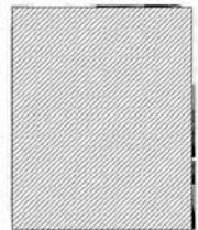
"Inner peace and tranquility." Cash Eckarte