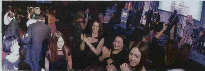
Attendees at the Empire Ball dancing in the Grand Hyatt New York.