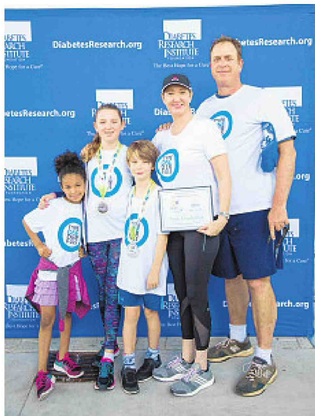
Team Type Onderfuls